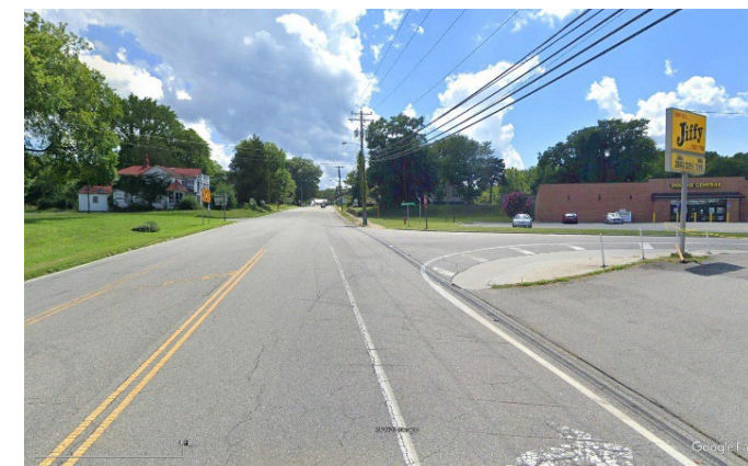
Route 501 (L.P. Bailey Hwy.) Route Bus 360 Intersection Halifax, VA

Available Allocations - $11 Million Purpose – Improve safety/traffic flow From – 0.111 mile west of Route 501. To – 0.071 mile north of Route Bus 360 Project Length – 0.18 mile Improvements –