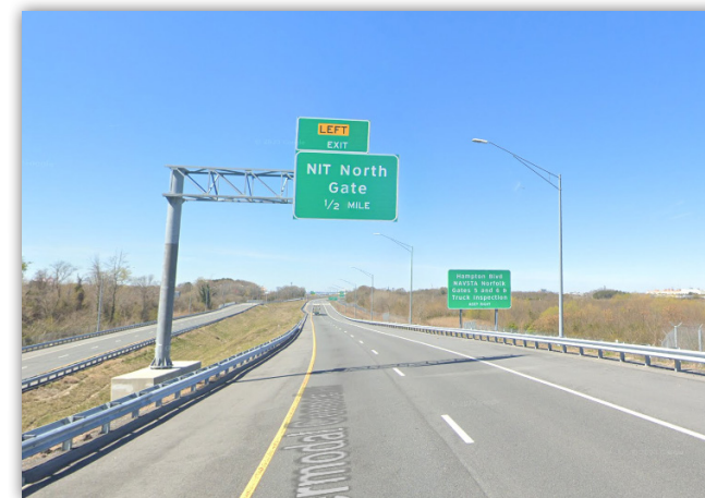
Westbound Intermodal Connector approaching proposed eastern intersection